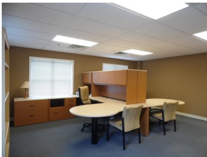
10412 Allisonville Road 112 2015-08-11 04.25.59 (2)