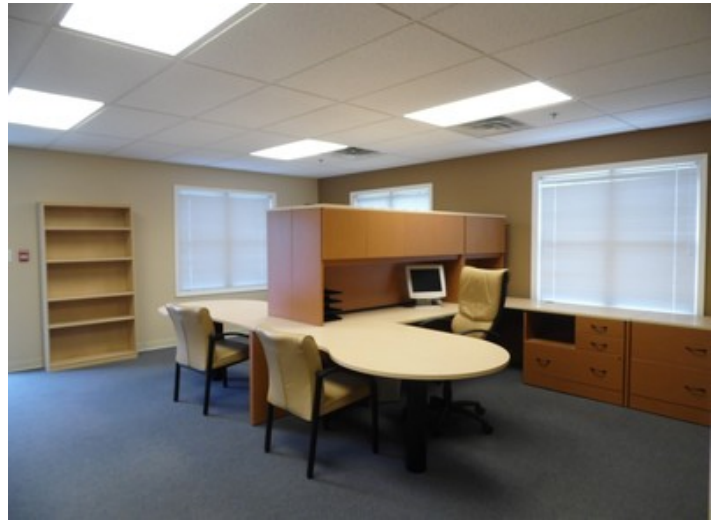
10412 Allisonville Road 112 2015-08-11 04.25.46 (2)