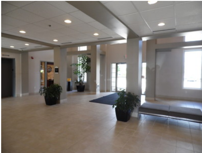
10412 Allisonville Rd 112 Lobby