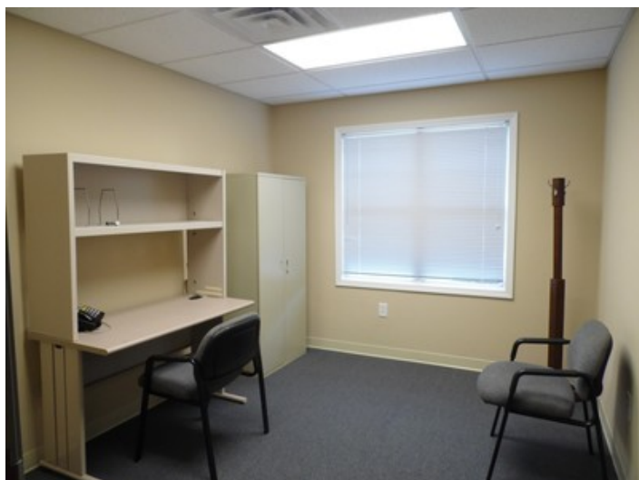
10412 Allisonville Rd. #112 separate office