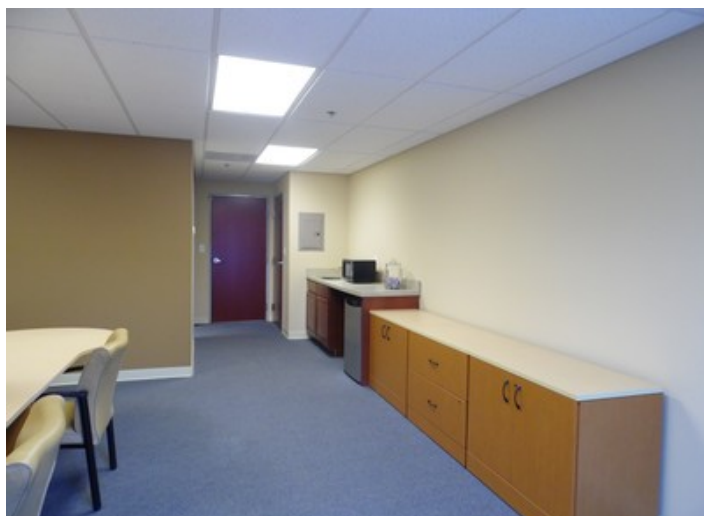
10412 Allisonville Rd 112 2015-08-11 04.26.09 (2)