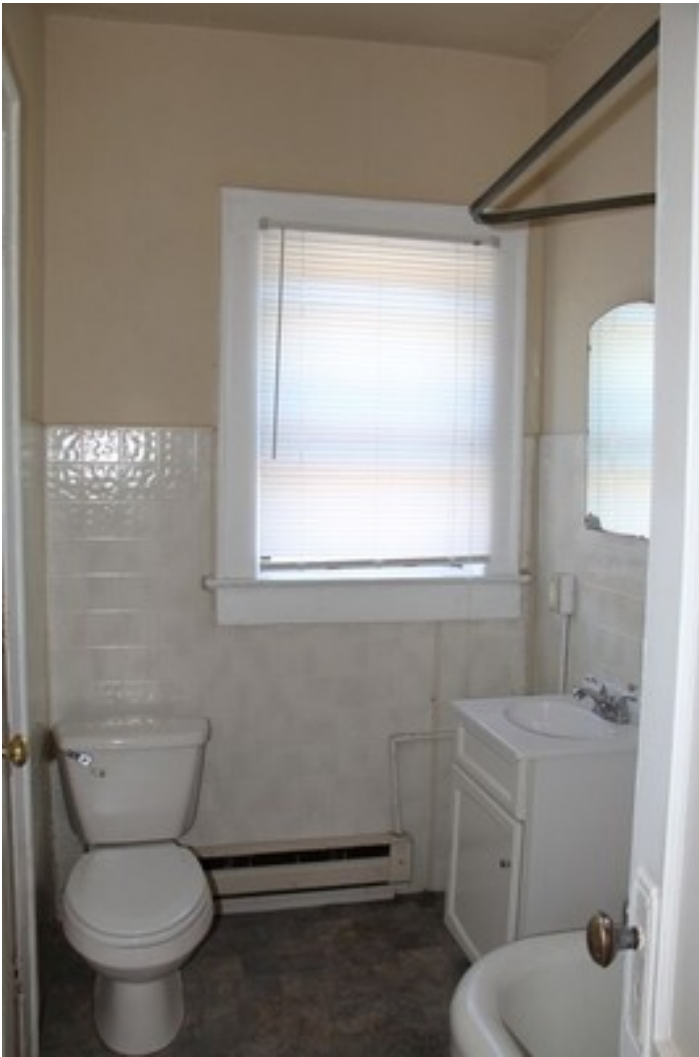
Dorchester bathroom with clawfoot tub