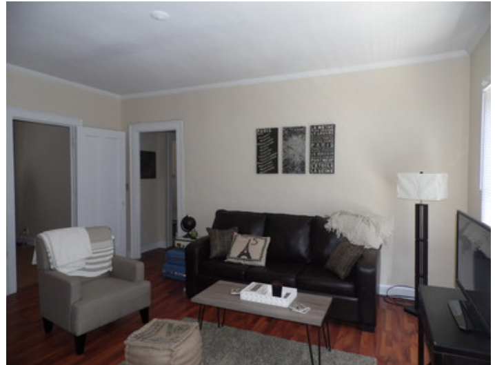
Dorchester Living room 2015-04-23 05.22.53 (2)