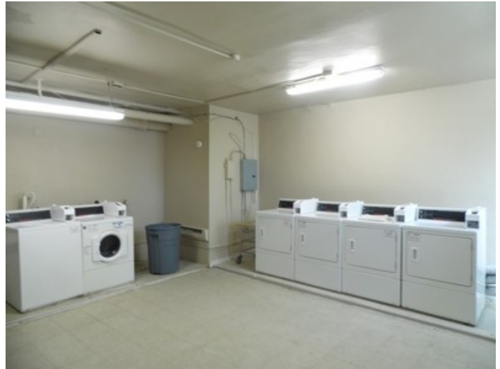
Dorchester Laundry Room 2015-04-23 05.08.40 (2)