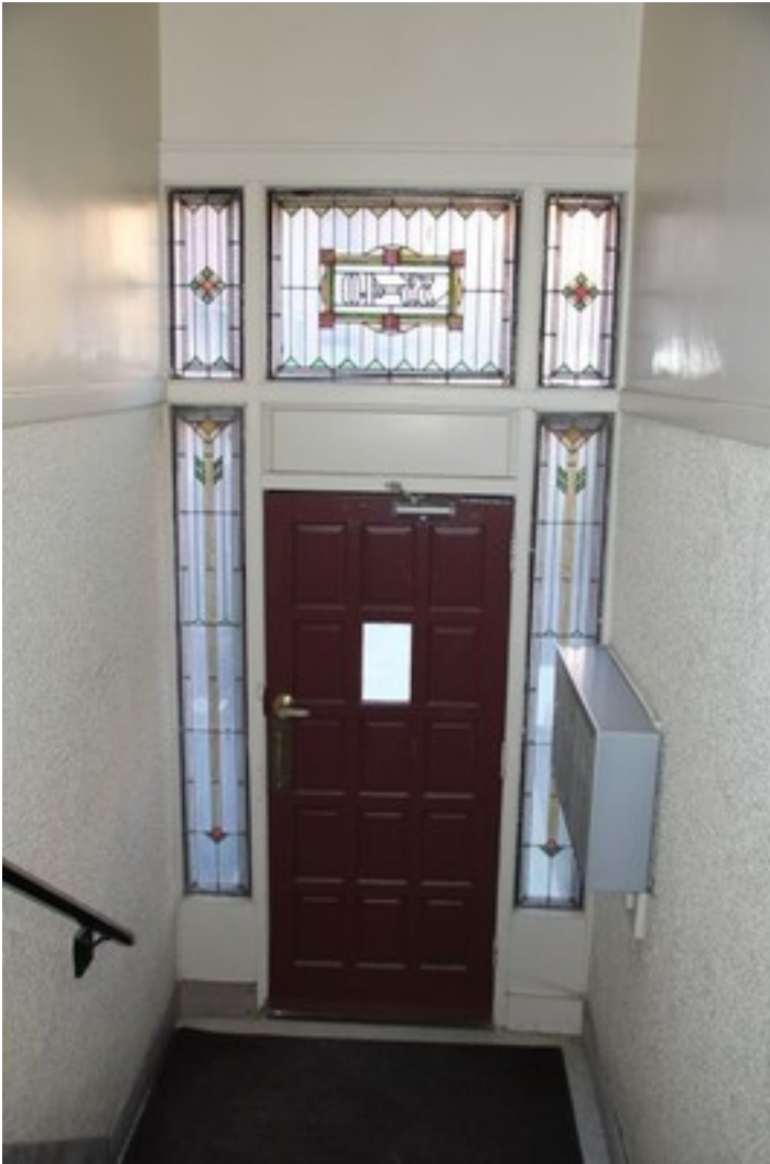
Dorchester stained glass doors