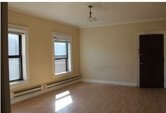
Dorchester LR larger with baseboard heat