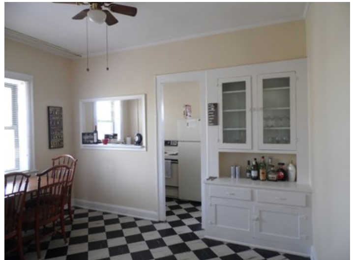
Dorchester Kitchen 2015-04-23 05.24.05 (2)